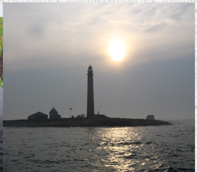
Petit Manan Island at sunset