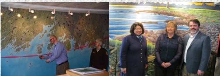
Another ribbon to cut!