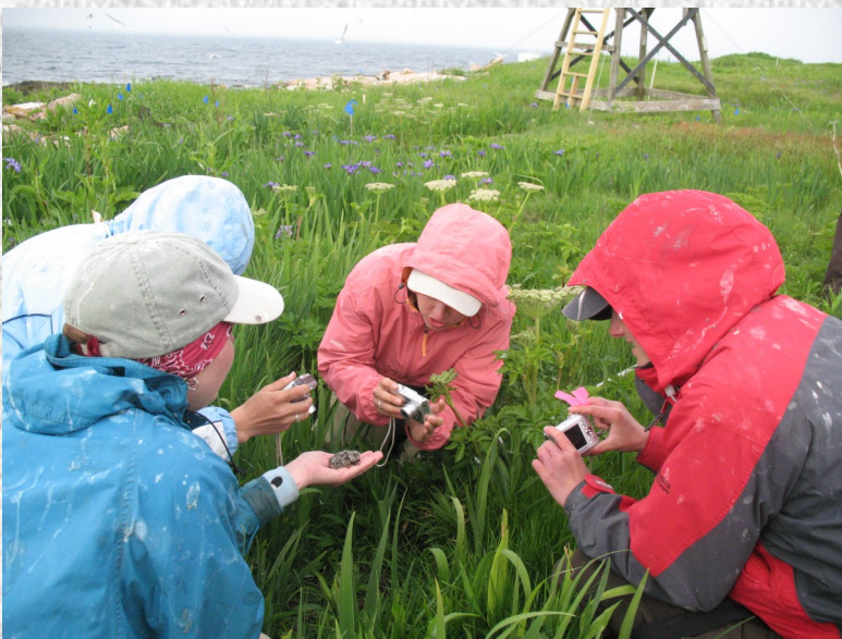
Island researchers are thrilled to see their first chick!