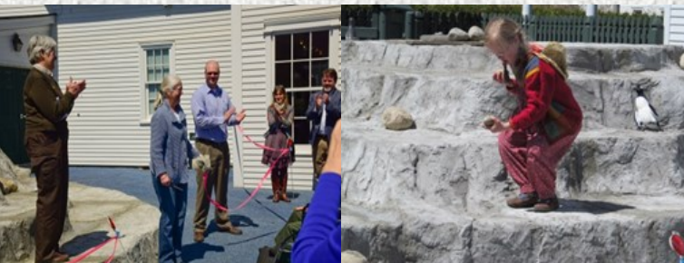
Cutting the ribbon - at last!

On May 2, FOMSI hosted an open house to screen our new orientation film and to show off our new replica island, giant coast map, and several other new exhibits. It was a well-attended celebration that recognized the generosity of our donors and the great progress we have made to welcome visitors to the Rockland center.