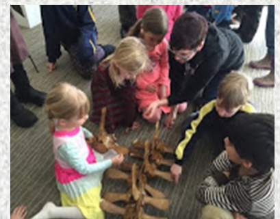
Assembling whale bones