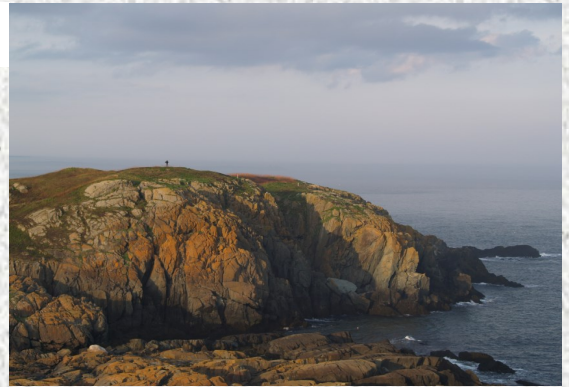
The magnificent cliffs of Eastern Brothers Island

As we prepare to say farewell to 2015 and greet a new year, the Friends of Maine's Seabird Islands (FOMSI) is preparing to enter 2016 with a new name. When FOMSI was established in 2003, our name was chosen to reflect the critical importance of the islands as nesting habitat for seabirds. As we have come to know the refuge better, we have realized that the islands provide so much more: nesting habitat for eagles and herons; stopover sites for multitudes of migrating songbirds, shorebirds and bats; pupping areas for seals; and places that people treasure for their beauty, lighthouses and recreational opportunities. In addition, the refuge has mainland units that protect other coastal habitats and offer more opportunities for hiking and wildlife watching. Since the refuge is about so much more than seabirds, we are changing our name to underscore that we support everything that the Refuge has to offer. Our new name reflects our commitment to showcase the Refuge in all its diversity.